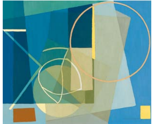
Painting 1951 oil on composition board National Gallery of Australia, Canberra Purchased 1969

Can you see where some of the colours have overlapped and shaded others in the painting?