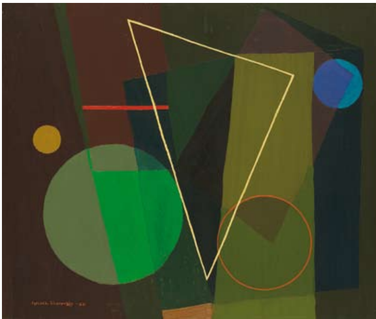
Painting 1950 oil on composition board National Gallery of Victoria Purchased 1967

Which shapes appear closest to you and which shapes appear furthest away?