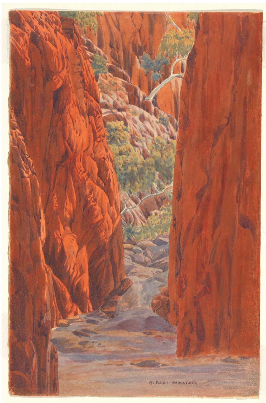
Albert Namatjira Standley Chasm about 1945

National Gallery of Australia Enterprise Agreement 2018 – 2021